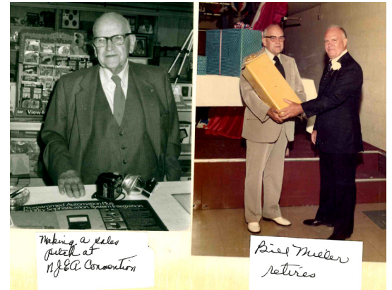
Making a sales pitch at N.J.B.C. Convention